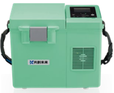
SALM FZ constant-temperature transportation device