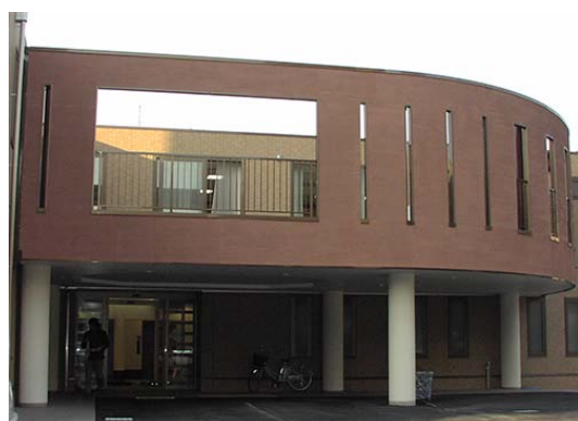
Day care center "Kagazaka Seikaan"